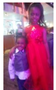
Above: a few photos from the awards night.