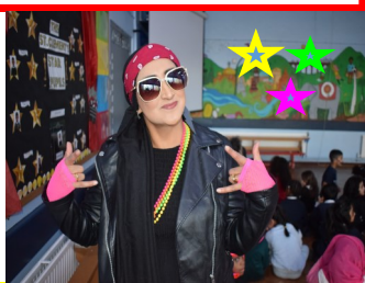
TT Rockstars day!!