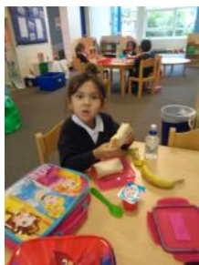
Nursery staying for lunch

What a busy half term we have had. Have a great break and see you in a week!