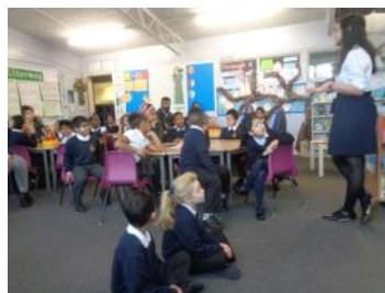
Year 3 Parent workshop

What a busy half term we have had. Have a great break and see you in a week!