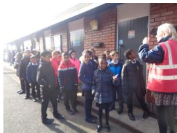
Year 5 learning about rail safety