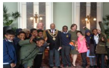
Year 6 meeting the Lord Mayor