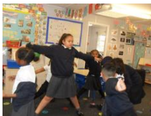
Year 1 Yoga