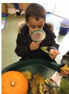
Reception investigating Autumn