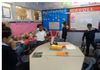
Year 4 practical science lessons