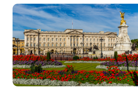
Tower of London Buckingham Palace